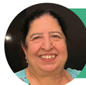
Bushra Nasir CBE